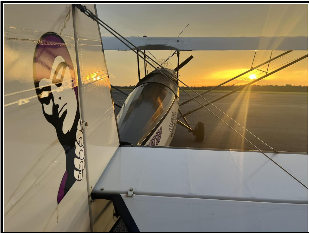
THE PHANTOM KNOWS... WE'RE BUILDING A PIET