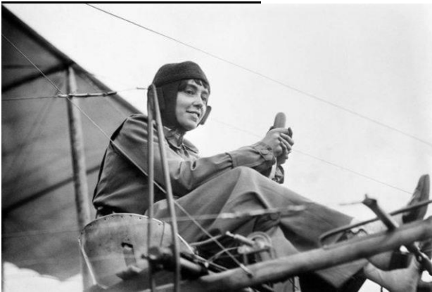
Helene Dutrieu, 1911 Not sure if I ran this one before