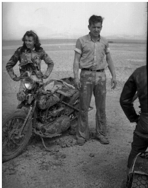
Fun in the mud.